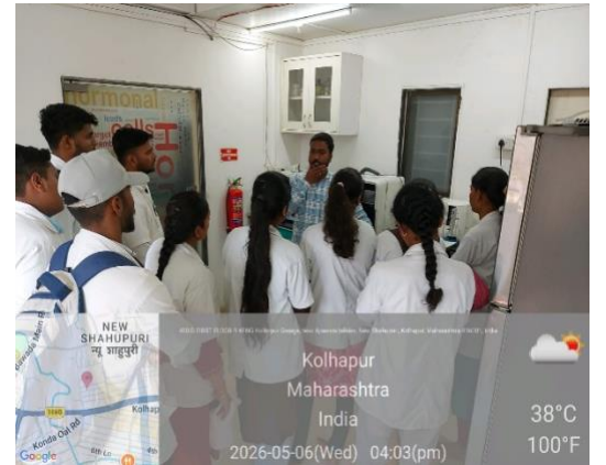
NEW SHAHUPURI न्यू शाहपुर्ी Kolhapur Maharashtra India 38°C 100°F 2026-05-06(Wed) 04:03(pm)