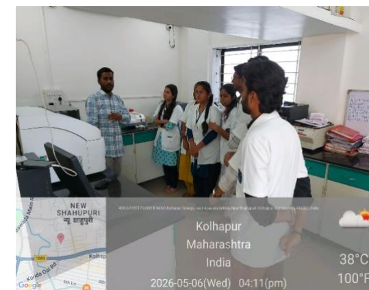
NEW SHAHUPURI न्यू शाहपुर्ी Kolhapur Maharashtra India 38°C 100°F 2026-05-06(Wed) 04:11(pm)