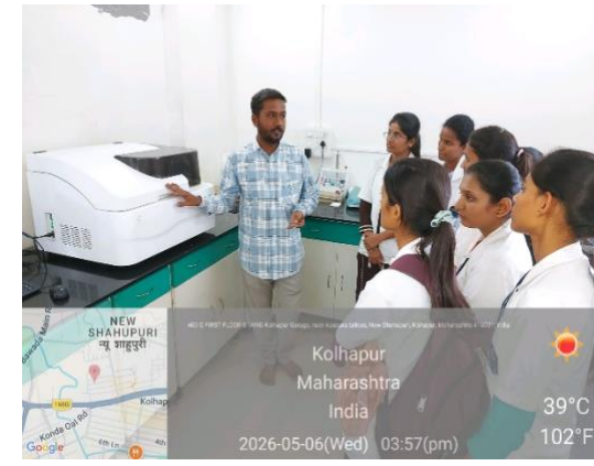
NEW SHAHUPURI न्यू शाहपुर्ी Kolhapur Maharashtra India 39°C 102°F 2026-05-06(Wed) 03:57(pm)