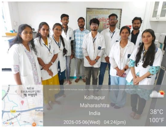
NEW SHAHUPURI न्यू शाहपुर्ी Kolhapur Maharashtra India 38°C 100°F 2026-05-06(Wed) 04:24(pm)