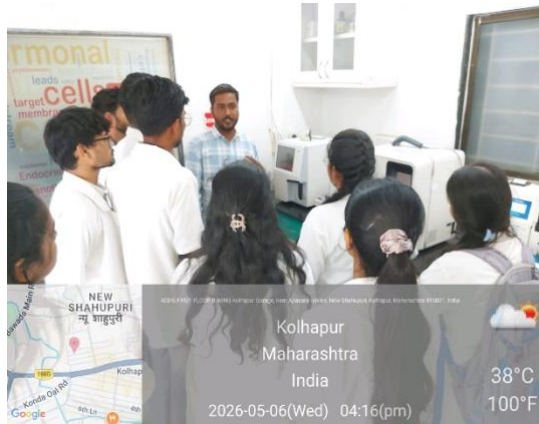
NEW SHAHUPURI न्यू शाहपुर्ी Kolhapur Maharashtra India 38°C 100°F 2026-05-06(Wed) 04:16(pm)