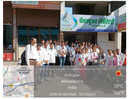
NEW SHAHUPURI न्यू शाहपुर्ी Kolhapur Maharashtra India 39°C 102°F 2026-05-06(Wed) 03:42(pm)